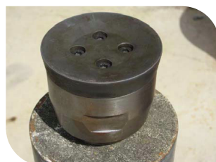
ODC – ring cutter