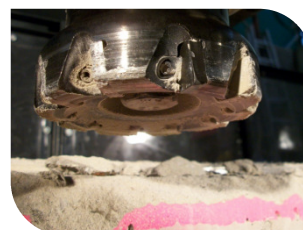
Milling tool for concrete