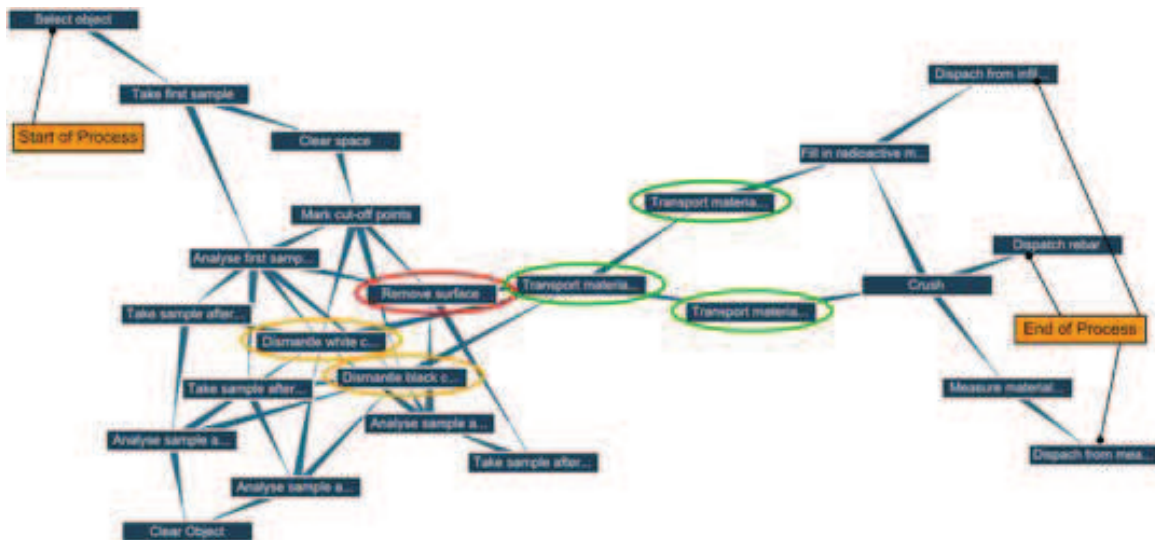
Figure 1: Structure of dismantling process with colour-marked planning scope

Modelling of the system helped understand its characteristics. Tasks and dependencies between them were documented in a flowchart and then translated into a force directed graph (figure 2). Dismantling of the large machine rooms is one of several phases within the decommissioning process of the nuclear power plant. A Crusher, a filling station for radioactive waste containers, and other machines as well as the logistics routes between these machines are used during several phases of the project. Thus, the planning of these facilities is not part of this case-study. Nevertheless, their existing design must be considered when evaluating the dismantling process of the large machine rooms. Further, design of sampling procedures and design of the analysis of samples is not within the scope of this case-study. The focus of this case-study is planning of the tasks ‘surface removal’ (circled red), ‘concrete dismantling’ (circled orange), and ‘logistic routing’ (circled green) within the overall system (figure 1). Complexity of the dismantling process becomes visible through the highly interconnected cluster of tasks on the centre left hand: interdependencies between tasks show the iterative nature of the process.